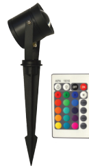
BlissLights Garden Accent Light 16-color user selctable